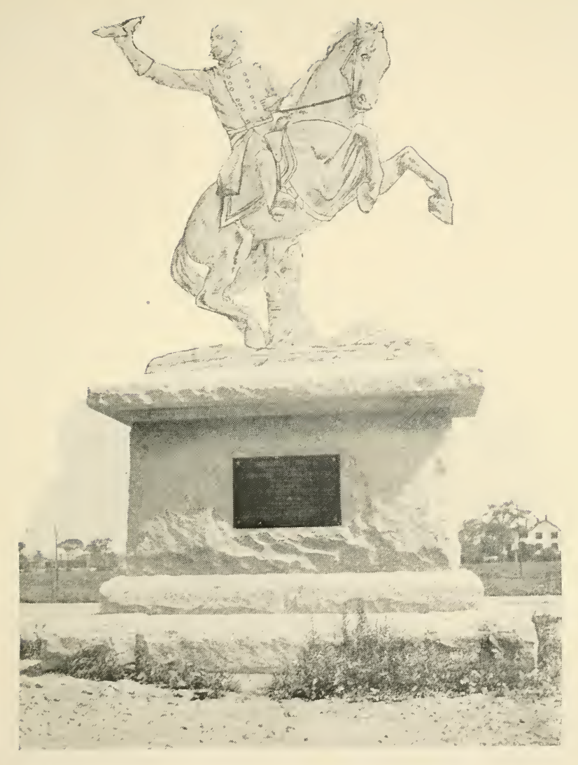
Monument to General Sheridan on Sheridan Drive as it will look when completed.